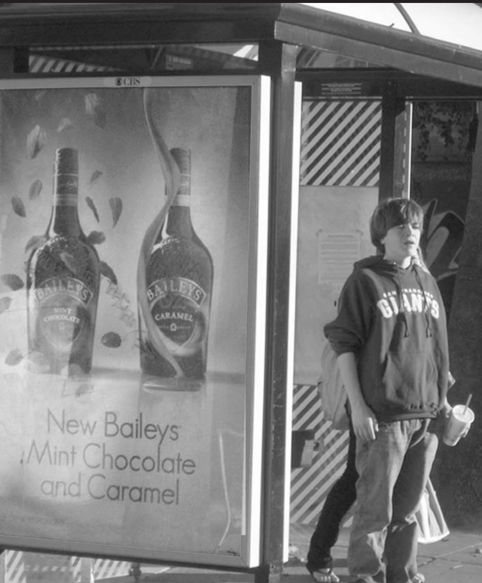
San Francisco bus shelter