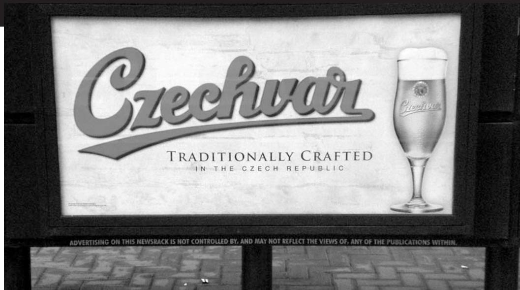
San Francisco news rack