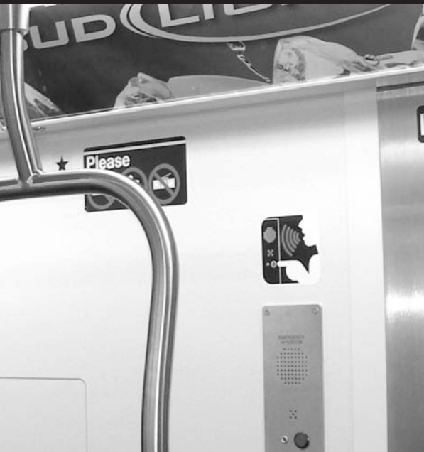
New York City subway