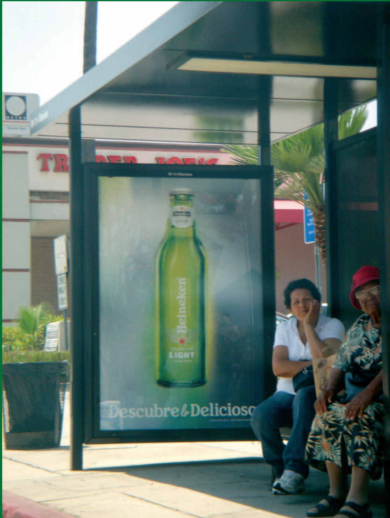
Los Angeles County bus shelter

Disclaimer: The information contained in this guide is not offered or intended to constitute legal advice. When finalizing any policy related to the strategies described we strongly recommend obtaining legal advice from a licensed attorney or government counsel in your local jurisdiction.