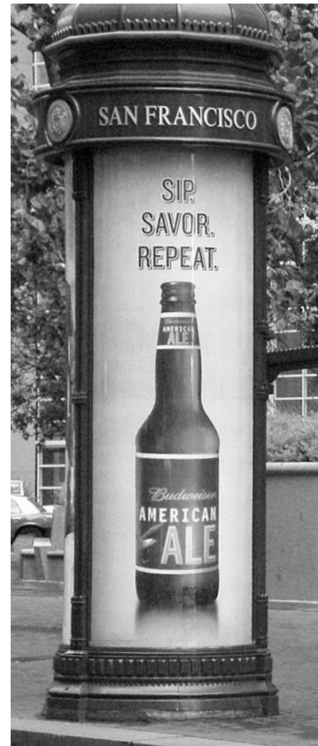
San Francisco news stand